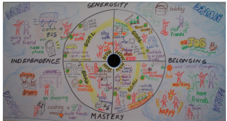
Figure 2: Graphed individual plan

Graphics were also incorporated into the transition planning for students at the same school (Espiner & Guild, 2011). In one example, a transition planning process was undertaken for a 19-year-old young man