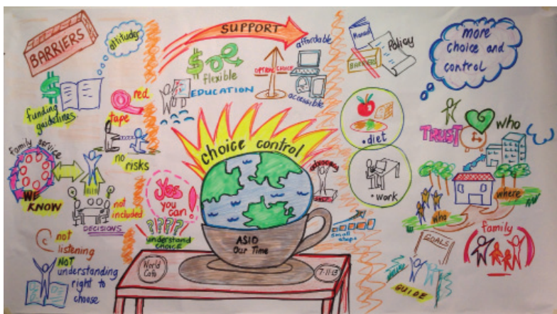
Figure 3: World Café

Graphic facilitation has been used successfully at a conference with a large group of participants adopting a World