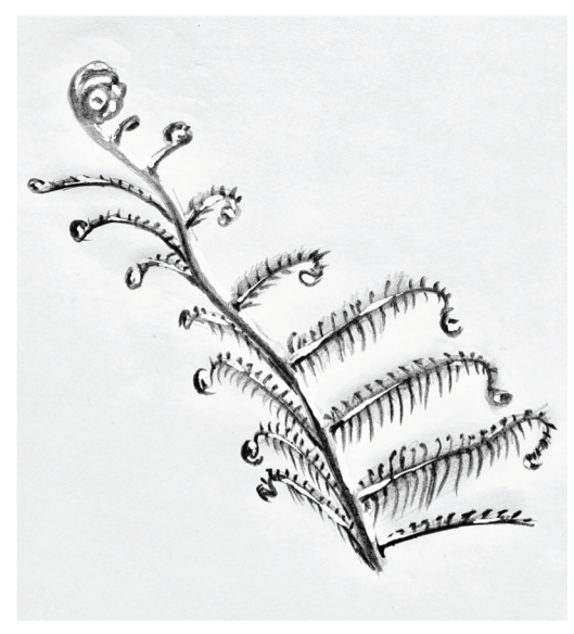
Figure 3 Third stage of the Koru Model – unfolding knowledge Original illustration by Simon Nash (used with permission)

We see the third phase of the koru model as unfolding knowledge, symbolised by the fronds of the fern unfurling (Figure 3).