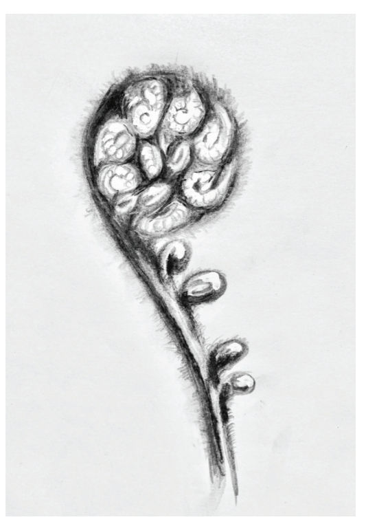
Figure 1 First stage of the Koru Model – newly arrived Original illustration by Simon Nash (used with permission)

We conceptualised the first phase as newly arrived, symbolised by the koru in a tightly coiled spiral (Figure 1). We see this early phase as being characterised by not knowing, disillusionment and confusion. The literature review revealed a number of authors who had conceptualised stages that people went through in moving into a new culture. While some of those stages described an initial honeymoon phase (Oberg, 1960), this phase was either very short lived or not apparent for participants who were immediately exposed to the need to practise from a bicultural stance. Some participants had done some initial research before immigrating, but most arrived with very little knowledge of te ao Māori. They had perhaps anticipated the need to integrate into Aotearoa New Zealand society without realising the bicultural layer that was required of social workers.