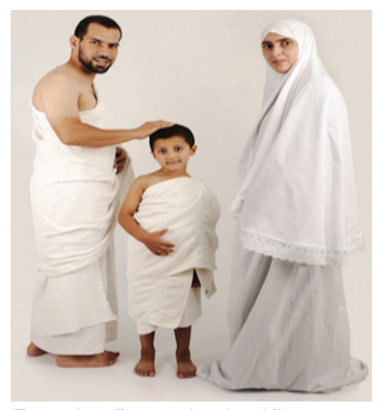
Figure 3. https://www.nooritravel.co.uk/ihram-48.

The tawaf has motions, that is moving and shifting, which are the symbols of success (Radan, 2009). Anticlockwise strategies of moving around the Kaaba are to keep the heart facing towards it so that the heart gets close to Allah's blessings. Above all, the seven sky analogy can be applied in the movement of seven circles. Each step represents a phase, first phase represents first sky and so on. Our Allah (creator) sits on the top of the seventh sky. By being able to complete seven circles, along with other rituals, it is perceived that Muslims feel that they get closer to Allah, hence the heart gets cleansed (Questions on Islam © 2003–2018).