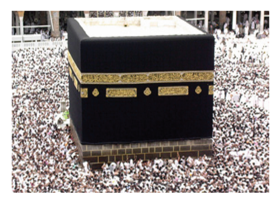
Figure 2. Centring Around the Kaba.

The tawaf has motions, that is moving and shifting, which are the symbols of success (Radan, 2009). Anticlockwise strategies of moving around the Kaaba are to keep the heart facing towards it so that the heart gets close to Allah's blessings. Above all, the seven sky analogy can be applied in the movement of seven circles. Each step represents a phase, first phase represents first sky and so on. Our Allah (creator) sits on the top of the seventh sky. By being able to complete seven circles, along with other rituals, it is perceived that Muslims feel that they get closer to Allah, hence the heart gets cleansed (Questions on Islam © 2003–2018).