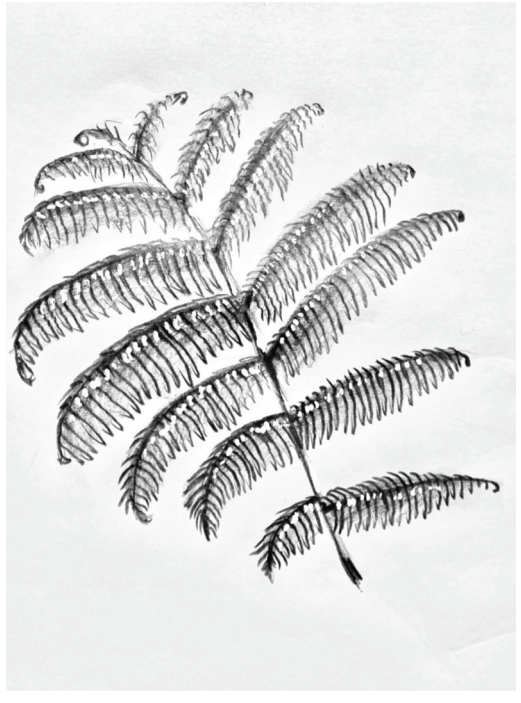
Figure 4 Fourth stage of the Koru Model – full frond Original illustration by Simon Nash (used with permission)

A few participants were able to situate themselves in Aotearoa New Zealand and feel their feet more grounded in their own identities and cultures. They described feeling less defensive and accepting of recognising where they "sat" in the particular cultural landscape. Nadia described being able to step away from some of the anger she perceived was being directed towards her: