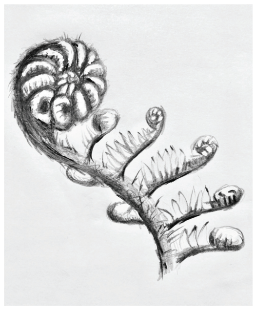
Figure 2 Second stage of the Koru Model – early growth Original illustration by Simon Nash (used with permission)

The second phase is perceived as early growth, symbolised by the koru starting to open (Figure 2). In this stage, people are becoming more aware of the need to learn about biculturalism and there is sometimes a sense that it is something that they have to do. There can be a sense of fear about practice with Māori and a sense of discomfort around making mistakes. For some participants who came from the UK, there was also a sense of guilt or shame from being associated with the coloniser. Many of the participants had engaged in some form of training about biculturalism by this time.