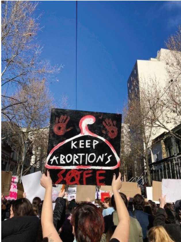
Figure 2: Abortion Placard

Note. Photograph by Kim Robinson (July 2022).